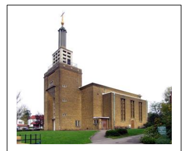
John Keble Church