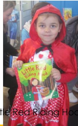
Little Red Riding Hood