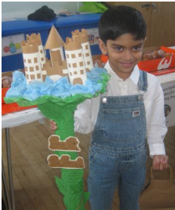
Jack and the beanstalk

Our red noses are now for sale every morning in the playground. Please note that these cost £2 each and we can only take cash. Noses are also available from the school office.