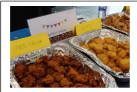
Summer Fair 2024